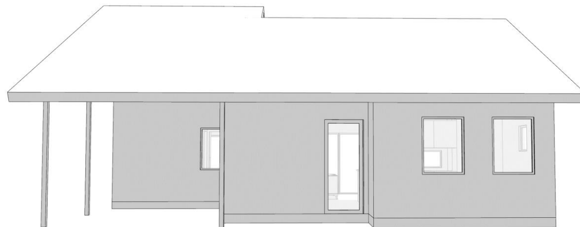
Optional Glass Front Door shown